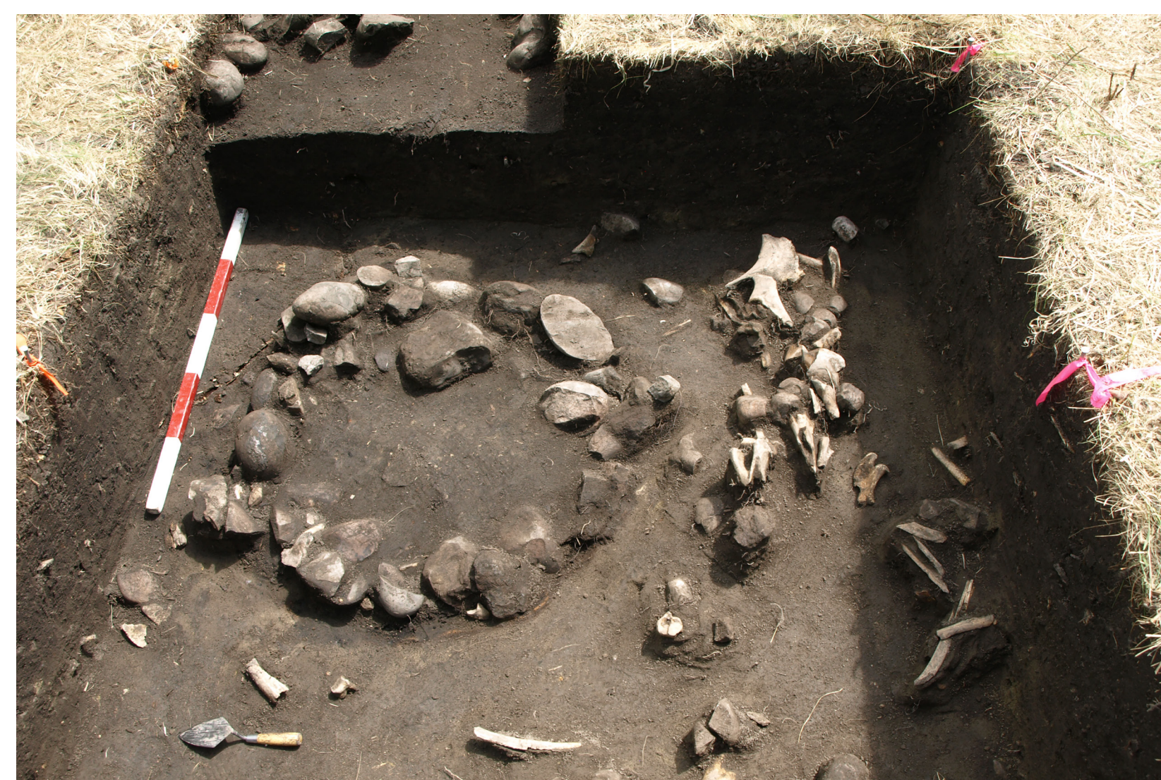
A roasting pit, to dry and prepare bison meat