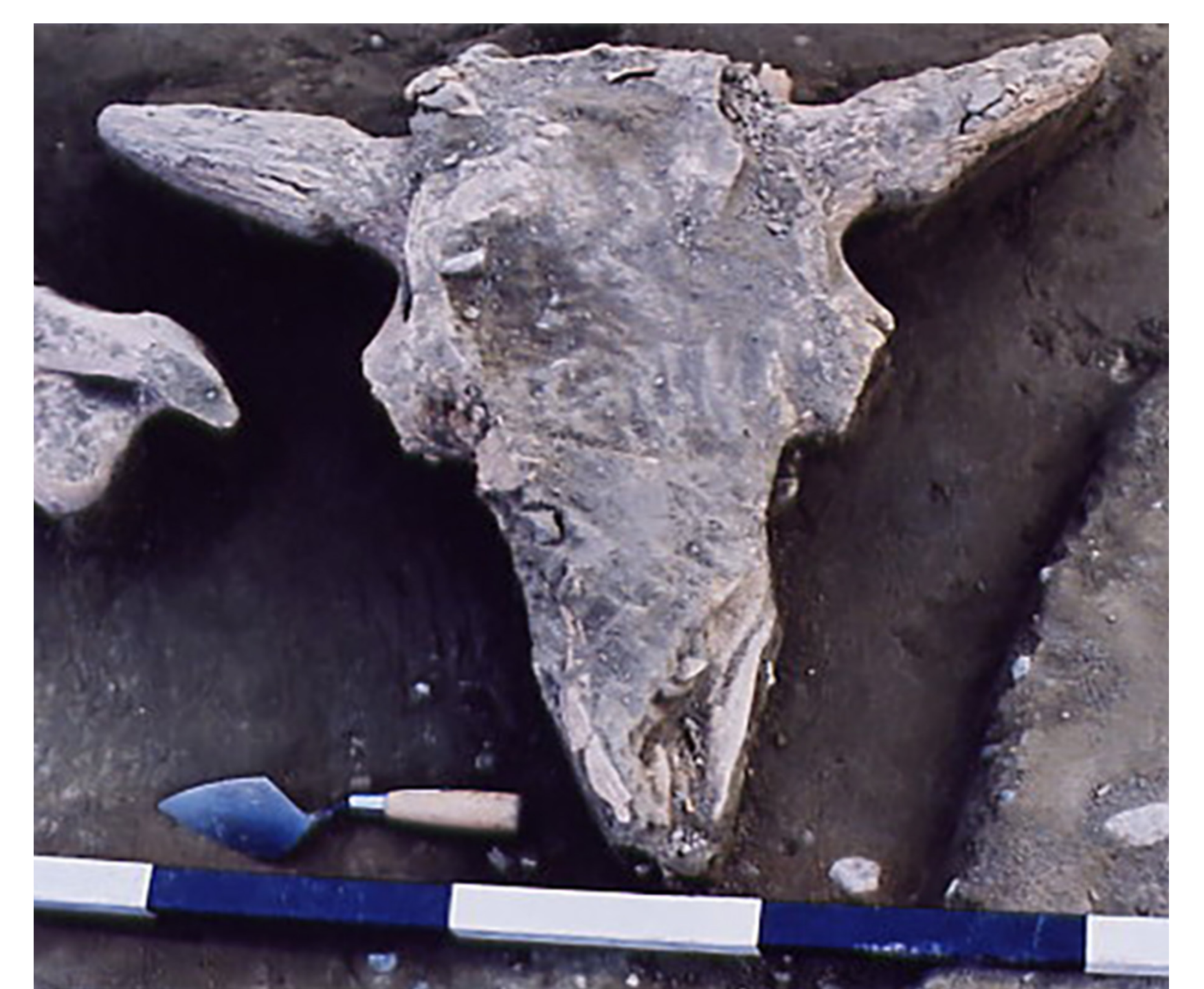
Bison skull excavated in Calgary