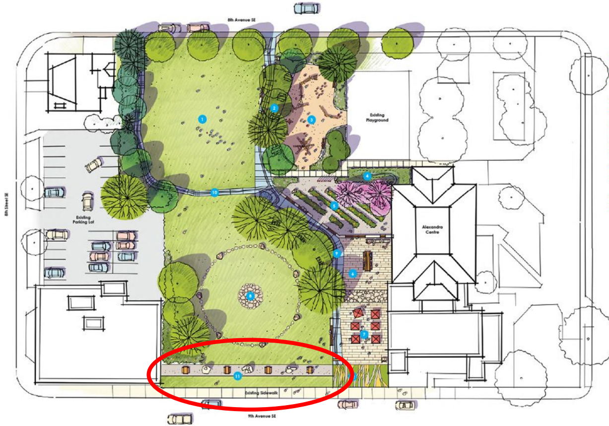
JACK LONG PARK Calgary, AB